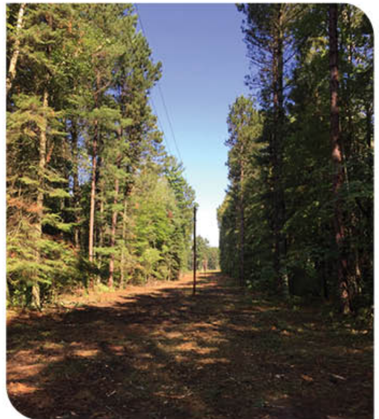
▶ This is good right-of-way clearance.

“Although herbicides don’t eliminate all trees from growing, it certainly minimizes the regrowth until we’re able to come back for the next rotation. At that time we will use considerably less herbicide for extra cost savings and start establishing