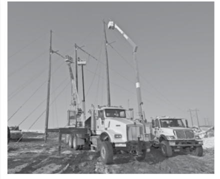
Crews work to relocate portions of the Ramsey-to-Grand Forks 230-kV line in northeast North Dakota. Winter construction provides many environmental benefits, including minimizing impacts to wetlands and protected species.

"The northern long-eared bat and Blanding's turtle populations in Minnesota are on various lists which protect them," Schmidt said.