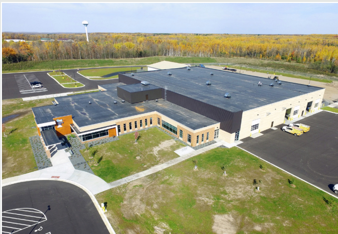
LCP Cohasset Service Center