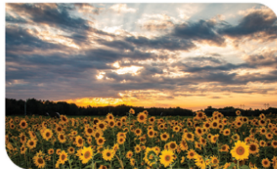
▶ Patty Maki of Gilbert photographed these pretty sunflowers and sunset at Owl Forest Farm in Iron.

Reviewed the results of the board district survey. Average district membership in February 2024 was 4,892 and districts were within the 10% change requirement, therefore no changes to board district boundaries were necessary. The districts will be surveyed again in 2025.