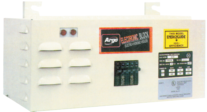
Electric boilers heat the in-floor tubing or hot water baseboards.