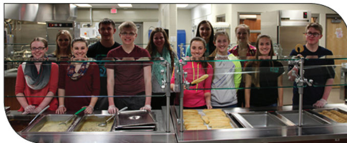
The National Honor Society will serve members another hot meal at South Ridge School.