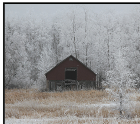
This picture earned a spot in the co-op calendar for Feb. 2017. Cheryl Bunes of Bovey photographed this old shed surrounded in nature's frosted beauty near Nashwauk.

Editor's Note: These board minutes have been condensed. A full copy of the board minutes can be read at www.lakecountrypower.coop in the "Member's Area." You'll need to sign up for access if you haven't already. Or call 800-421-9959 for a printed copy.